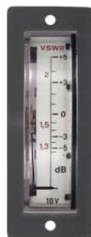
DC : ME70, AC : CE70