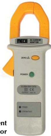
DC Current Adaptor