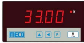
SMP35SN - Voltmeter