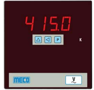
SMP9635SN - Voltmeter