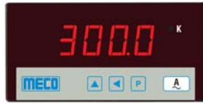
SMP35SN - Ammeter