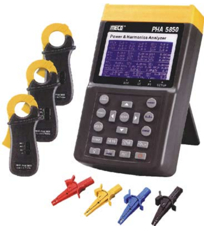
"POWER & HARMONICS ANALYZER – Model 5850"

Model 5850" Analyzer which is a state of art versatile instrument using micro controller technology and having various functions that would be ideal for any Engineer / Inspector for carrying out Vigilance checks, Surveys, Audits and Periodic Visits for checking at Industrial and Consumers end.