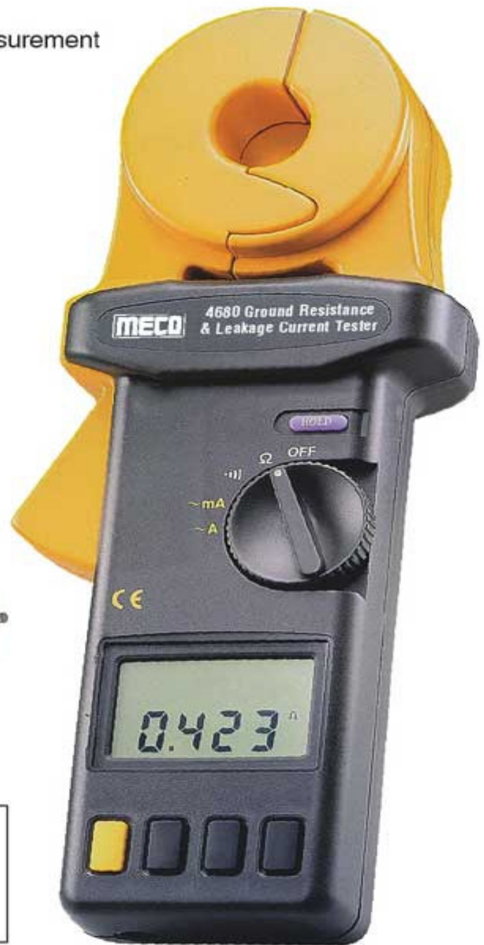
Model : 4680