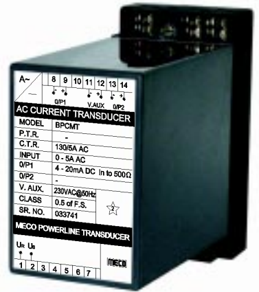
BPCMT, BPCMT - TRMS

MECO AC Current Transducers measure AC Current and converts it to an industry standard output signal which is directly proportional to the measured input. These Transducers provide an output which is load independent and isolated from the input. The output can be connected to Controllers, Data-Loggers, PLC's, Analog / Digital Indicators, Recorders for display, analysis or control. They are ideal for SCADA, Energy Management, Telemetry for Remote, Local as well as Central Monitoring Systems.